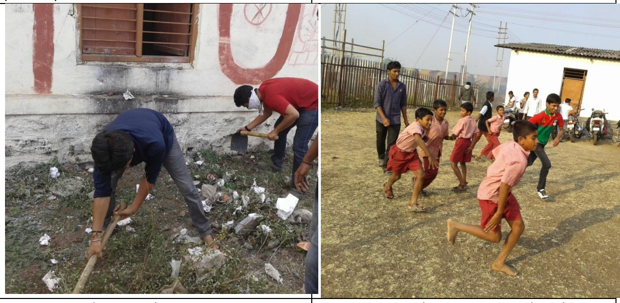
Pic-3 : NSS students are cleaning campus as camp location Maniknangr, SangliMiraj (1-2-14)