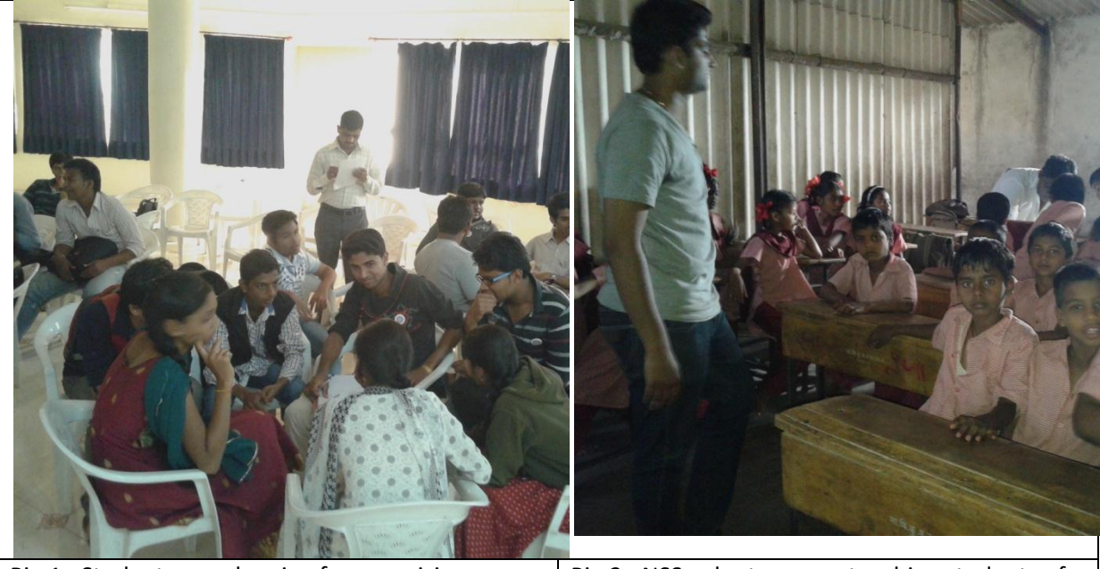
Pic-1 : Students are planning for organizing activities in school – camp place – Mankinanagr (28-1-14)